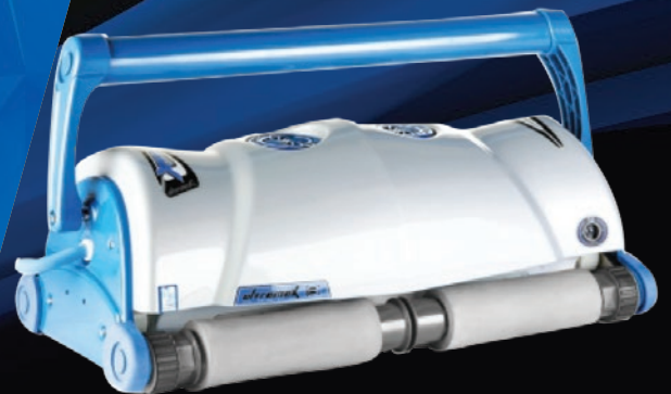
ULTRA MAX G