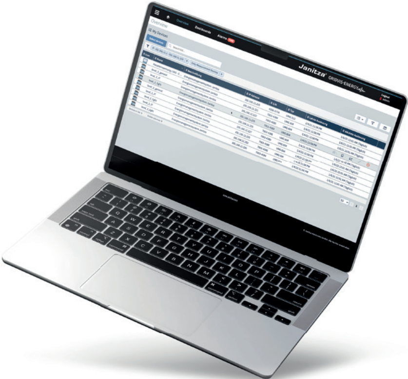
The power grid monitoring software GridVis® stands for certified energy management in accordance with ISO 50001