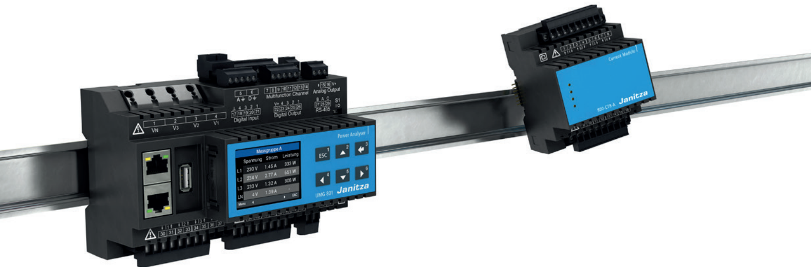
The UMG 801 power analyzer can be expanded with modules to up to 92 measurement channels or up to 144 digital inputs