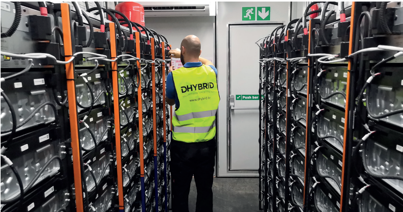
With a capacity of 1,027 kWh, the lithium-ion memory units bridge the nights and days with little sunshine

The Cheetah Plains Lodge in South Africa offers its discerning guests a stay far away from civilization. This includes unique safaris with electric-powered Land Cruisers. Guests and management also place great value on minimal noise pollution, low environmental impact, and sustainability. The previous energy supply was no longer able to meet these requirements. It consisted almost exclusively of diesel generators. Their performance, environmental impact, fuel costs, and power quality no longer met the requirements of a modern facility. The previous stand-alone system was supplemented by a single-phase connection from the local energy supplier, but its capacity was limited and it exhibited considerable voltage variations.