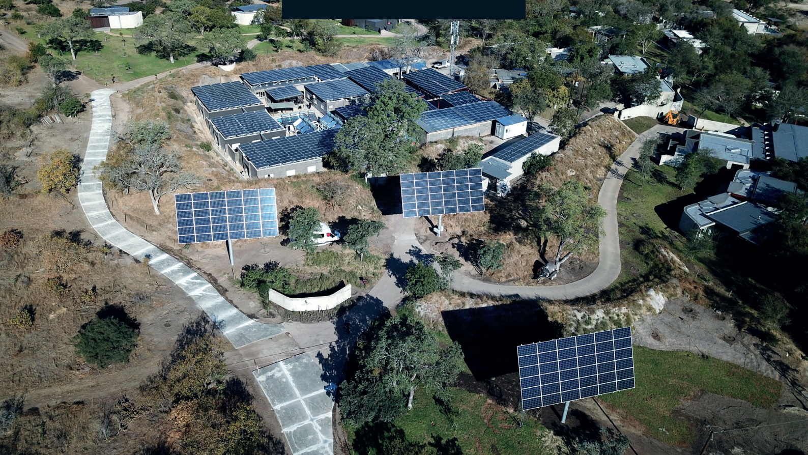
260 kWp roof systems are installed on the carports and employee accommodations