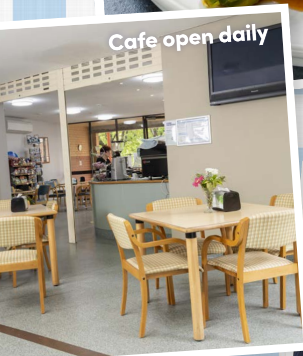
Cafe open daily