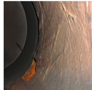
Protective coating inside disch. pipe flaking off at flange