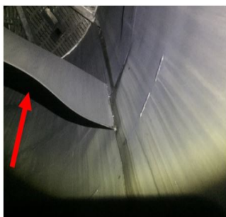
Deformed plates and buckled scrubber housing