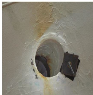
Temporary repairs on hull performed by diver on another vessel