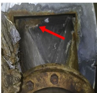
Cracks on water drain outlet (viewed from outside) with signs of leakage