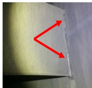
Poor workmanship: Support plates only spot welded by yard