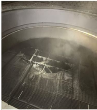
Burnt mist eliminator