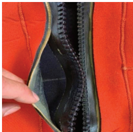
Zipper failure due to glue separation