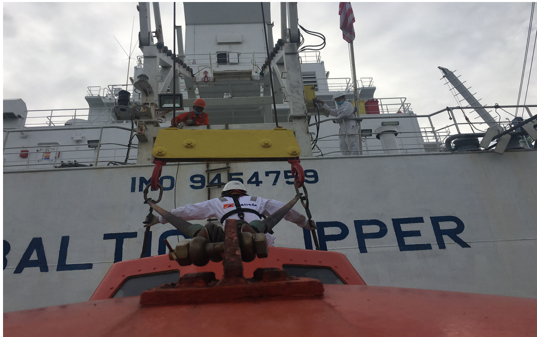
Safety first: Working onboard the Baltic Klipper .