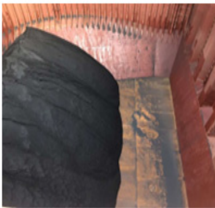
Upon completion of loading first parcel

The vessel had loaded a parcel of Chromite Ore at Durban in cargo hold no. 1 and proceeded to sea while waiting for subsequent parcels to be loaded. The cargo had been declared as Group C with no declared moisture content (MC) and transportable moisture limit (TML). While waiting for further cargo, the Master reported that the cargo was showing signs of liquefaction. Investigations revealed that the cargo was fine particles and had flow potential. Recent heavy rains likely contributed to the elevated moisture content in the stockpiles, which were exposed to the elements. The shippers provided an updated cargo declaration, where the name of the cargo was amended from “chromite ore” to “Chromite Ore (metallurgical grade concentrate)” and Documentation for MC and TML was provided as well, although the cargo was still declared as Group C. The vessel was subsequently detained by South African Maritime Safety Authority (SAMSA). The detention note stated “Cargo had shifted rendering the vessel unseaworthy, and cargo information provided before loading did not match the cargo loaded onboard” .