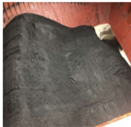
Cargo surface flattened and water accumulation noticed a day later