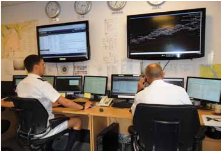
Operations room UKMTO

It is important that vessels and their operators complete both the UKMTO Vessel Position Reporting Forms and register with MSCHOA